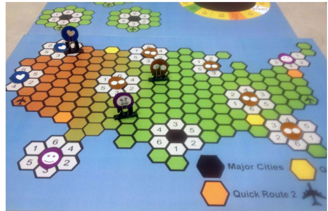
Figure 4: A second StarStruck game state example. Here, the orange player had a strong lead, and was close to winning the pre-finale bonus. However, the pink and blue players decided to form an alliance in which Blue gave money to Pink in exchange for his star (collaborating). Blue was then able to complete an objective card task and take the pre-finale bonus for herself. Had Pink or Blue formed an alliance with Orange, the game could have ended differently. This example demonstrates how the metagame can impact the game state.

During gameplay, players have the option of playing with different conflict resolution styles by focusing on competition, collaboration, avoidance, compromise, and accommodation. Players can also express themselves in the metagame through forming alliances, bargaining, or even potentially trash-talking. Fellowship is afforded in this game as players are given the option of forming alliances. If