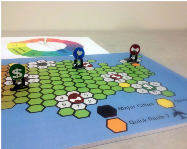
Figure 3: Example of an intermediate StarStruck game state. In this scenario, the red player has already captured several cities. Meanwhile, the (otherwise meek) blue player was looking to fulfill an objective card that encouraged conquering a city owned by a powerful player. Blue was thus prompted to compete with Red for control of a territory. Red had several options, including engaging in a dice battle for the city (competing), ignoring the confrontation (avoiding), bribing Blue to leave (accommodating), working out a trade with Blue (compromising), or asking a neighbor, like the green player, for help (collaborating).

their identities through choosing their character. Any character chosen is race neutral by default, and can be associated with any gender. This is similar to Zork: Grand Inquisitor 's labeling of the player character as AFGNCAAP (Ageless, Faceless, Gender-Neutral, Culturally-Ambiguous Adventure Person). Characters are instead associated with a unique symbol that reflects their values. Each character represents different qualities: popular, wealthy, powerful, generous, or wise. If a player identifies with one of these characters or wants to be more like a certain character, they have the ability to do so. By giving participants the option of playing in an initially AFGNCAAP role, players are given more opportunities to express themselves and explore familiar or new conflict resolution strategies. They can choose to play as someone with whom they relate (or not!), which allows for a deeper connection with the game world and focused exploration potential. We chose to base our game's location in the United States because we would be playtesting with American students who would have an interest in "conquering" local cities with which they are familiar. Additional realism is achieved by the inclusion of chance cards similar to those in Monopoly as a means to simulate real life events.